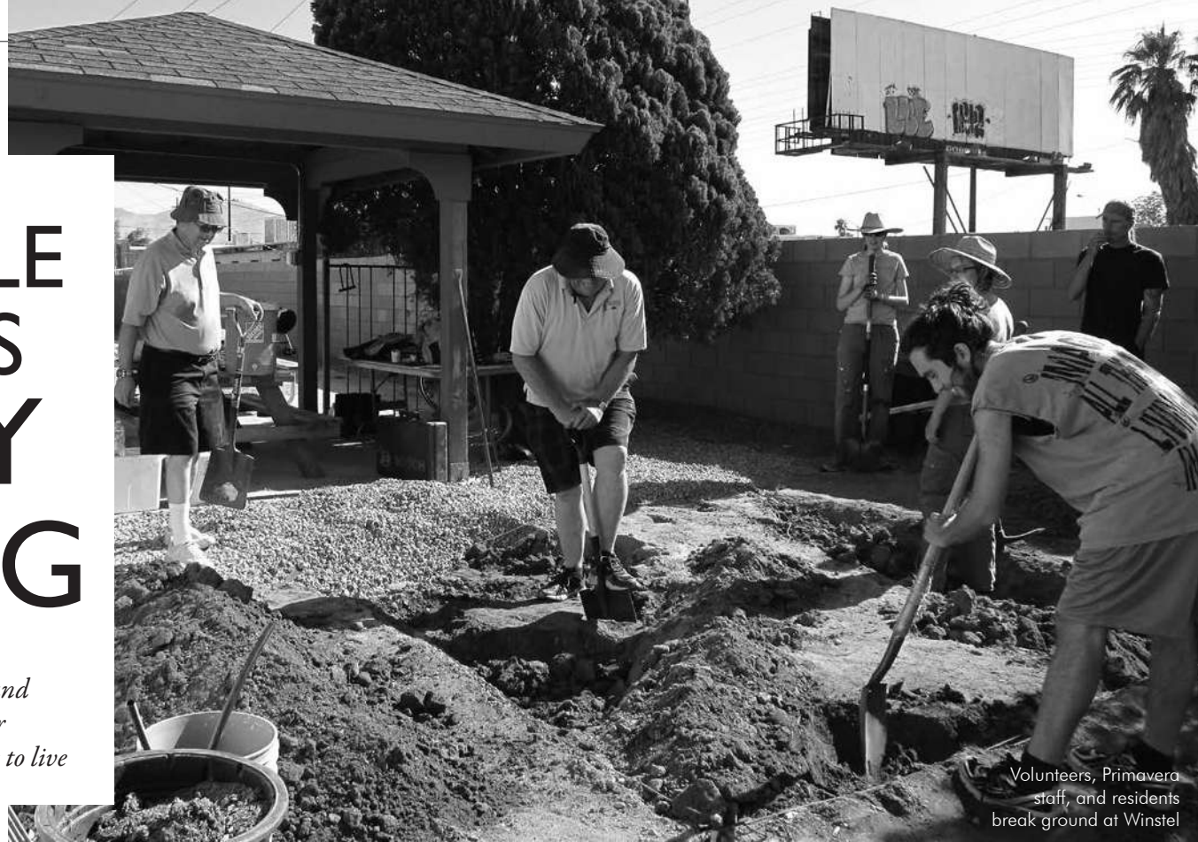
Volunteers, Primavera staff, and residents break ground at Winstel

Composting, community support, gardening, and a long-term permaculture plan are turning our affordable rental properties into premier places to live