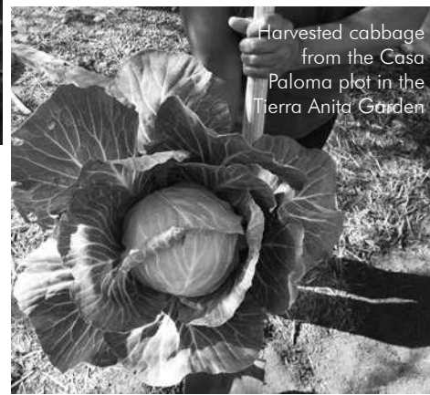
Harvested cabbage from the Casa Paloma plot in the Tierra Anita Garden