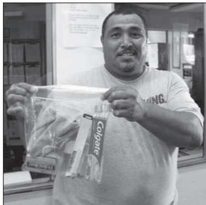
A Men's Shelter resident shows off the toiletries kit given to each man after the dinner.